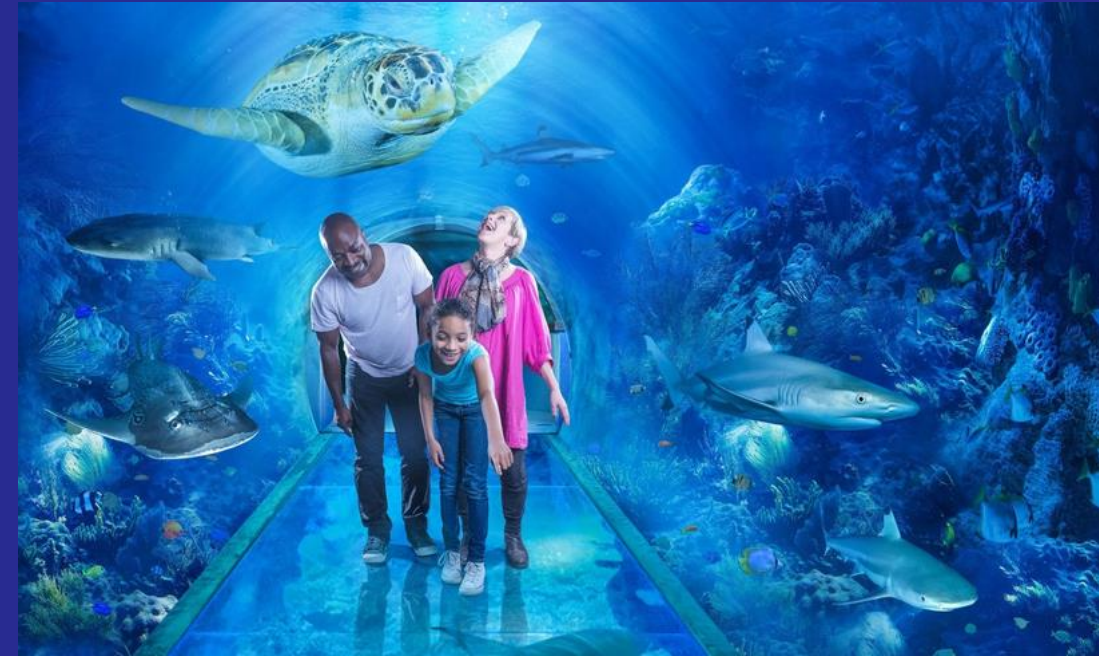
The fish and animals