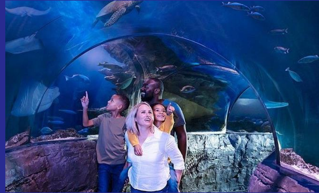
A tunnel you can walk through