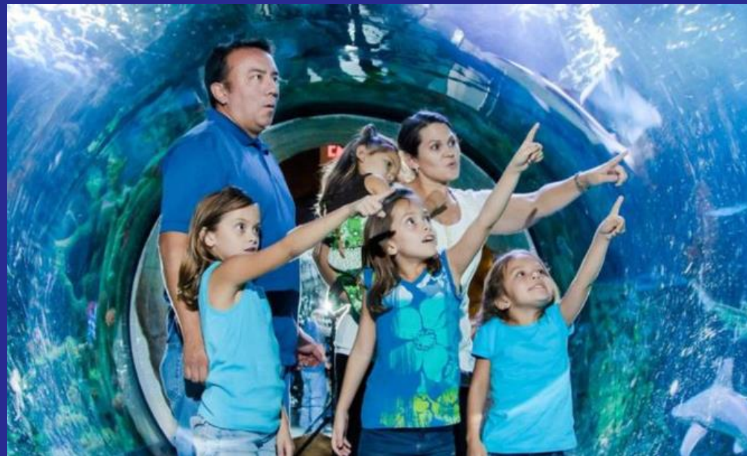
The sound of other children