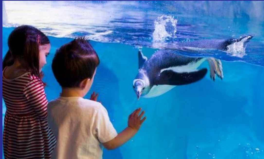
Lots of water and blue lights