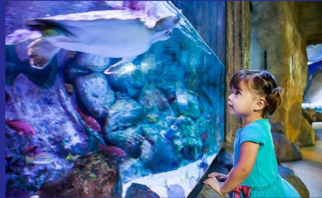
The sound of water