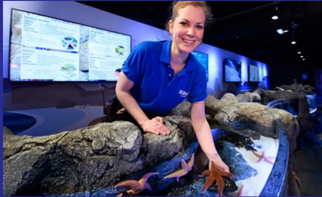
A team member talking