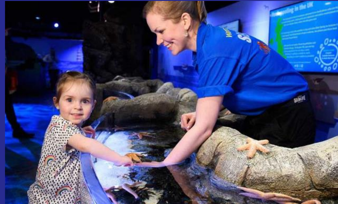
A rockpool area