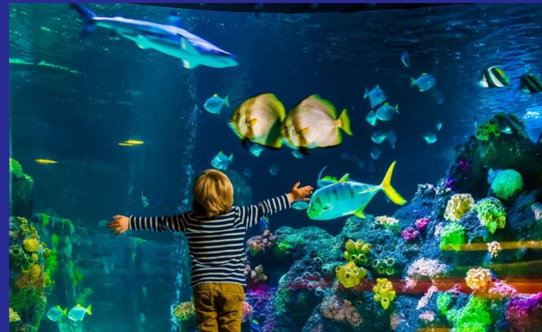
Soft background music