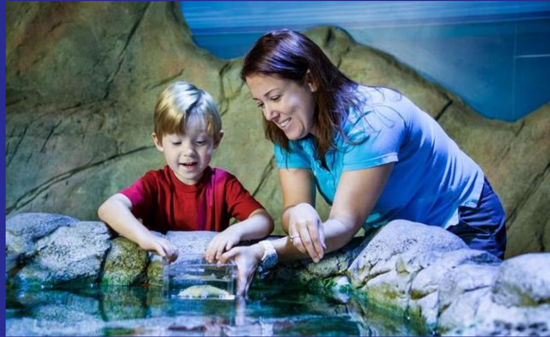
Cold water in the touchpool