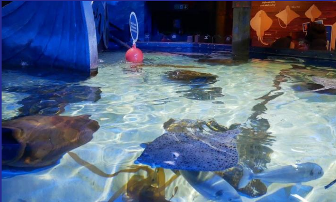
A seaside smell (shells)